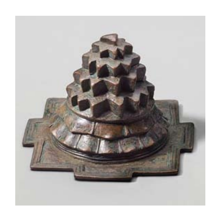
Shri Yantra India, 17th/18th century Bronze, width 13 cm Joost van den Bergh

Joost van den Bergh will be presenting Indian visual art derived from tantric thought and practice in an exhibition titled 'Magic Markings'. Van den Bergh was first struck by tantric art in the early 1990s, when he came across the 1971 catalogue from the 'Tantra' exhibition at London's Hayward Gallery. 'The highly abstract, geometric and