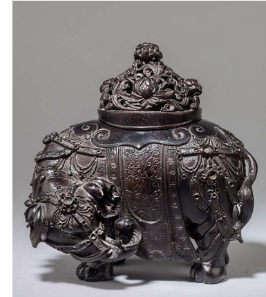
Incense burner China, Ming dynasty, 16th/17th century Bronze, height 16.5 cm Ben Janssens

lacquer box carved with lychees, possibly used in the Qing court. Brushpots, stands and incense burners are also featured. (3–11 November: 91C Jermyn Street)