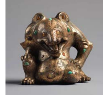
Bear China, Han dynasty (206 BCE–220 CE) Gilt bronze with agate and turquoise inlays, height 10.6 cm Eskenazi

Eskenazi 's exhibition this year will feature 24 diverse examples of early Chinese art from the late Neolithic to the Tang, many from private collections. The core of the show is a group of bronze