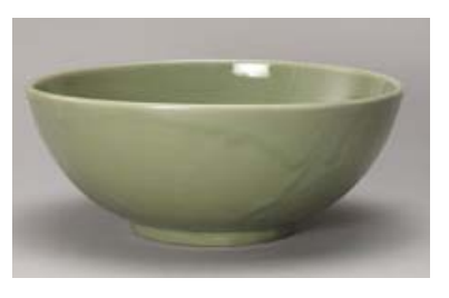
Bowl China, Longquan, 13th/14th century Stoneware with celadon glaze, diameter 36.8 cm Berwald Oriental Art

Specialists in Han to Qing period Chinese ceramics Berwald Oriental Art will be exhibiting recent acquisitions. Highlights include a large Longquan celadon bowl from the 13th/14th century, formerly in the Idemitsu Museum of Art in Tokyo. (1–11 November; 17 Clifford Street)