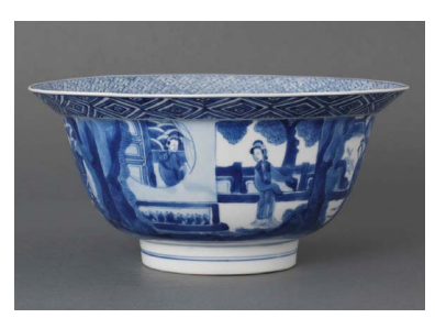
Bowl with scene from Romance of the Western Chamber China, Kangxi period (1662–1722) Porcelain with underglaze cobalt-blue decoration, diameter 20.3 cm Marchant