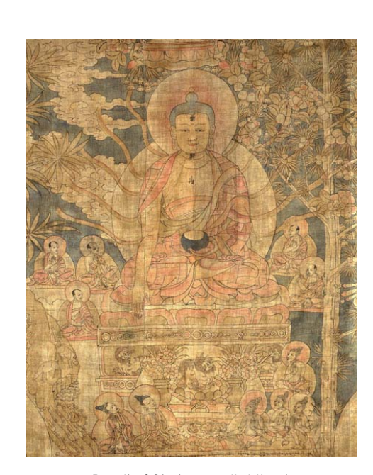
Detail of Shakyamuni's Miracles Eastern Tibet, 14th century Distemper on cotton, 241 x 172 cm Rossi & Rossi