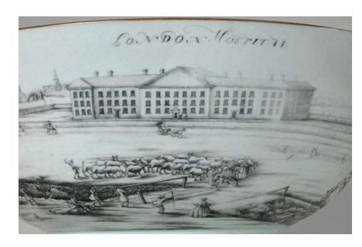
Detail of punch bowl showing the London Hospital China, Qianlong period (1736–95) Porcelain with grisaille and gold decoration, diameter 40.3 cm Jorge Welsh

Jorge Welsh will be celebrating their 30th anniversary with a show titled 'A Time & A Place: Views and Perspectives on Chinese Export Art'. From the 18th