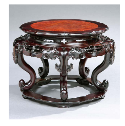
Stand China, 19th century Hongmu , diameter 26 cm Fleurdelys Antiquités

Fleurdelys Antiquités, who specialize in antique Chinese wood stands and works of art, will be showing some unusual stands in their exhibition 'The Art of Display'. Traditionally considered an essential element in the display of Chinese artworks, stands are often made of exotic